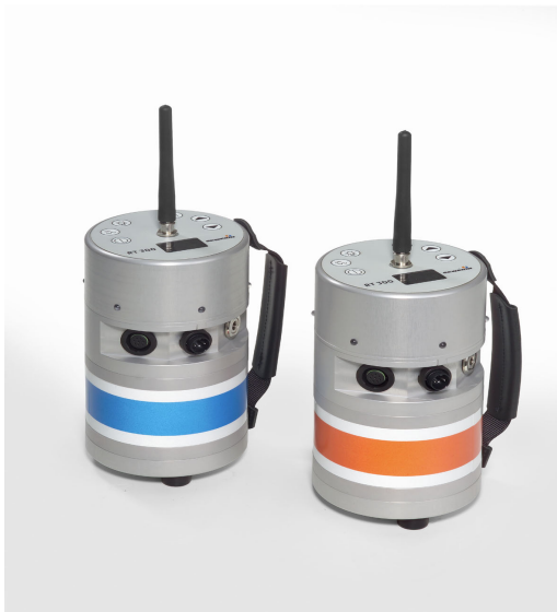
Radio transmitter RT 300