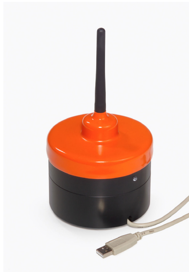
Radio receiver RX 300

Sewerin applies new technologies to reduce interferences in water leak detection as far as possible. Leak noises are already digitalised inside the microphone and then digitally transmitted via the radio transmitter RT 300 to the radio receiver RX 300. The high frequency provides the required transmission capacity on the radio link. This also ensures that a maximum on information is taken out of the leak noise.